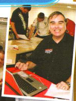
Above: Conference centre was turned into the pits